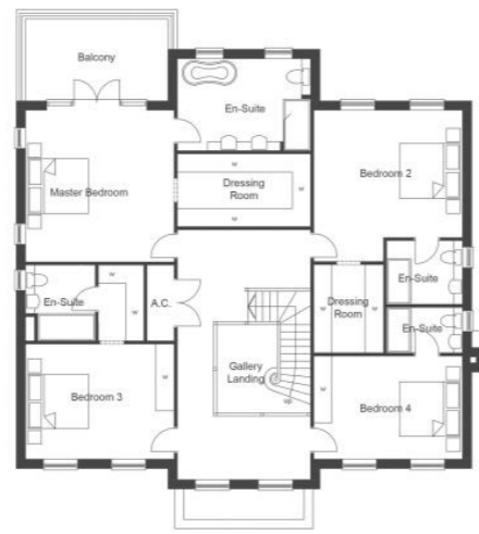
Proposed First Floor Plan