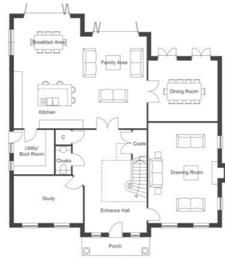
Proposed Ground Floor Plan